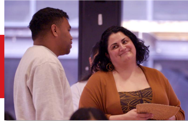
Le Moana Mua Award