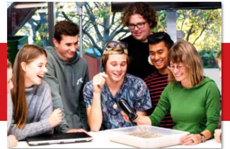
General Award Individual / Group

One Prime Minister's Educator of the Year Award will also be awarded to the nominee whose portfolio the panel agrees best exemplifies the overall criteria.