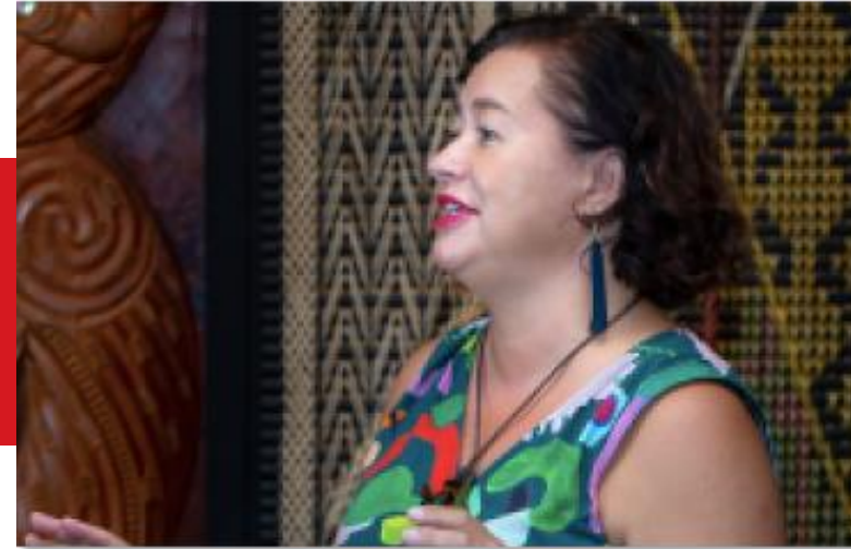
Kaupapa Māori Award