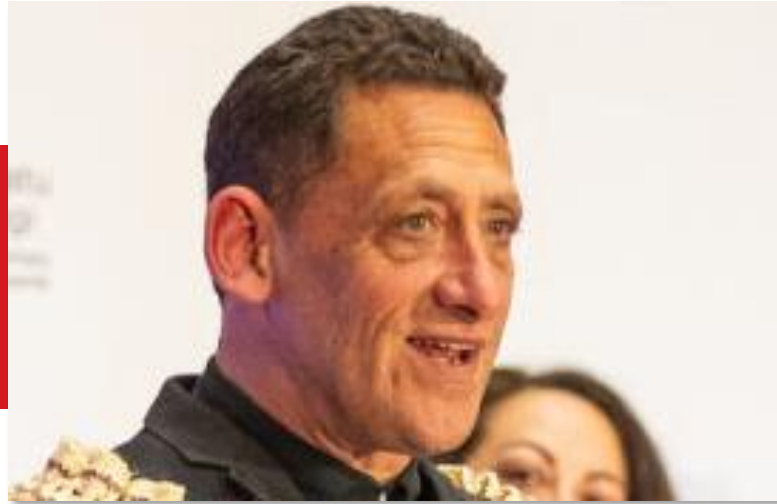
Te Tohu Reo Māori Award